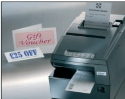
Fast and accurate voucher endorsement