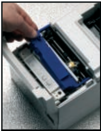
User friendly with simple ribbon replacement