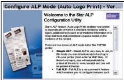
Easy-to-use AutoLogo™ graphics tool able to configure / download up to 15 coupons without any expensive software changes using a simple wizard-driven utility. Load & "ID" a graphic to then trigger a profit-making coupon etc.