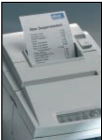
High quality 203 dpi logo and barcode printer