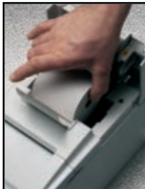
"Drop-In & Print", Easy-load