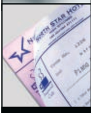
Up to 4 part slip station - perfect for warranty and DIY applications