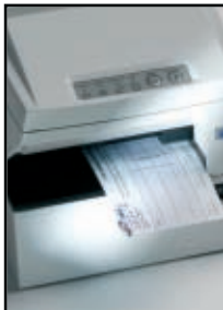
High quality, single pass cheque printer